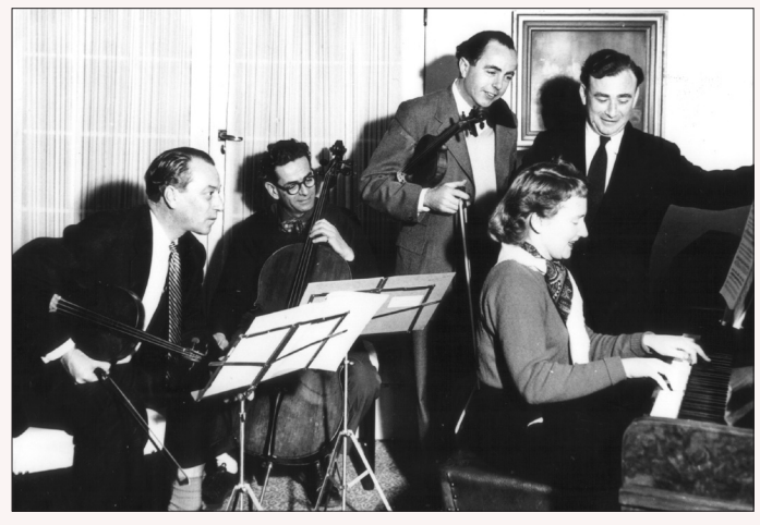
The Griller Quartet with Hephzibah Menuhin in 1953

Early in 1939 the Grillers visited the United States for the first time and the following season they returned, despite the outbreak of war: on 13 January they played Bloch's Quartet at Town Hall, New York. "Quite remarkable was the purity of tone maintained in every measure of the four movements, the unswerving fidelity to pitch and the suppleness of phrase everywhere present, even in the most complicated passages," Noel Straus wrote in The New York Times, although he felt the performance too restrained. Back in Britain, the Grillers were taken into the RAF as an ensemble and frequently appeared at Myra Hess's National Gallery Concerts, airing Bloch's Quartet several times in 1941 and 1942 and performing most of the great piano quintets with Myra Hess. On 17 May 1943